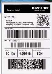
Variable barcode types available (1D/2D)