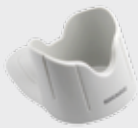
▪ HLD-G040-WH: Desk/Wall Holder, G040, White